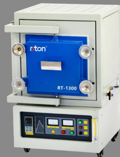
气氛退火炉 Atmosphere Annealing Furnace 200*170*150mm(L×W×H)