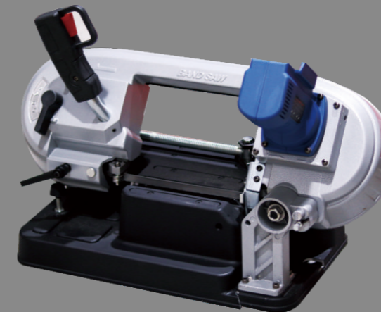
小锯床 Mini Sawing Machine 68×37×30cm (L×W×H)