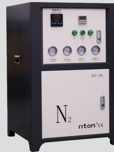
制氮机 Nitrogen Generator 55×55×85cm (L×W×H)