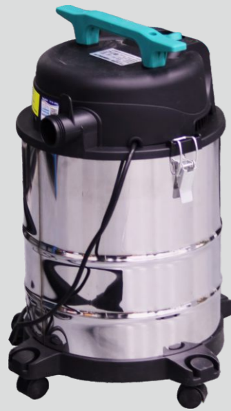
吸尘器 Vacuum Cleaner φ28.5×50cm (H)